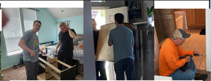
"The Crew" helping move furniture and fix a door & dresser for a Journey Home Guest.