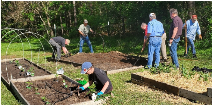
CrossRoads Life Group planting our garden!